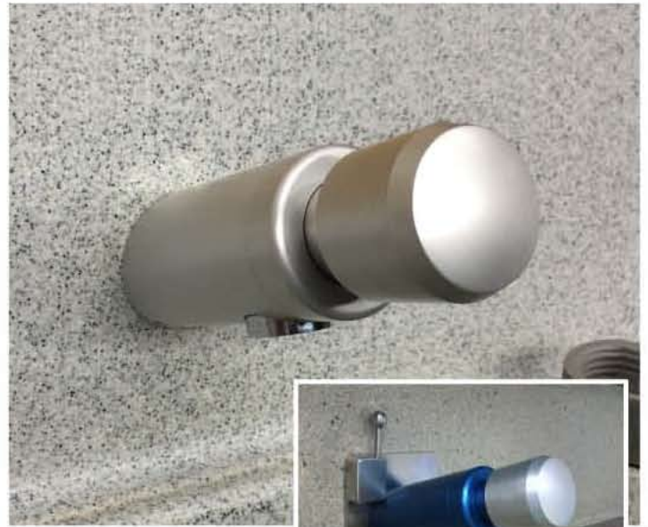
Adams Rite conversion bracket option shown